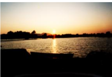
Sunrise on the Willamette River

Developing the Willamette Ecosystem Marketplace . This report documents work completed under our Targeted Watershed Grant from the U.S. Environmental Protection Agency. People have enjoyed the full report, but if you only have a little time, we suggest you read the lessons learned sections of chapters 3-7 and the full chapters of 9 and 10