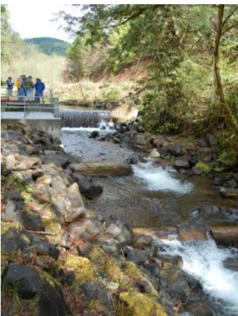
Fish Ladder, Clear Creek, Tualatin Basin

Look for the first draft methods to come up in Winter 2008 or Spring 2009 with tools following shortly thereafter. This work will be completed by August 2010.